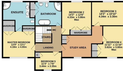
TOTAL FLOOR AREA : 2566 sq.ft. (238.4 sq.m.) approx.

Whilst every attempt has been made to ensure the accuracy of the floorplan contained here, measurements of doors, windows, rooms and any other items are approximate and no responsibility is taken for any error, omission or mis-statement. This plan is for illustrative purposes only and should be used as such by any prospective purchaser. The services, systems and appliances shown have not been tested and no guarantee as to their operability or efficiency can be given. Made with Metropix ©2025