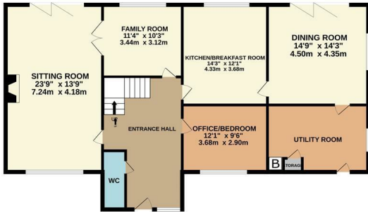
GROUND FLOOR 1273 sq.ft. (118.3 sq.m.) approx.